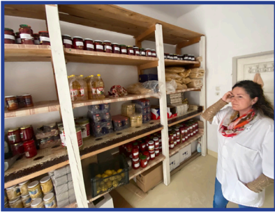
Food storage thanks to greenhouses you provided