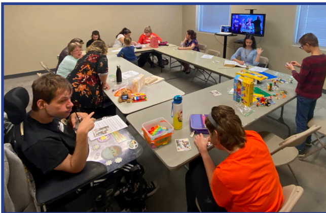
The King's Table class at New Life Church 2023

Since the first of the year, churches in the Colorado Springs area have begun to inquire of disability ministry and how we can help. In meetings with church leadership, families with disabled members and ministry groups, helping them chart a path to including those families within their local communities has begun. This has enabled us to learn more of our community and how to better serve the churches and these families. At New Life Church, the King's Table, a